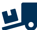
Tared and loading

Before leaving PPL, escape hood must be returned.